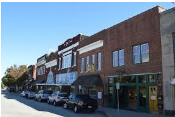
Roxboro Main Street

The Pivot COVID program is administered by the Kerr Tar Council of Governments, a voluntary group of governments that meet to promote regionalism and provide resources for the participating municipalities. The Kerr Tar Council has a similar revolving loan program, allowing for efficient administration of the Pivot loans. The application process is completely online, increasing its accessibility and reach. 2