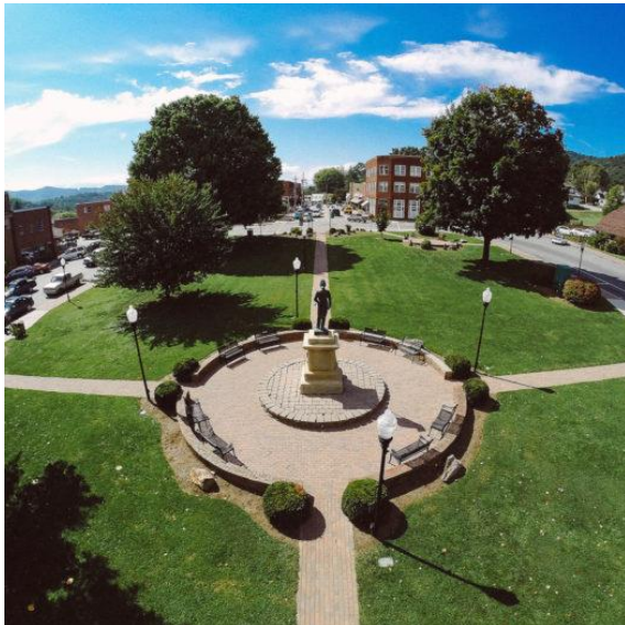
Burnsville Town Square

DEAP is a $2,500 lump sum grant available for new businesses or expanding existing retail businesses in downtown Burnsville. By limiting this grant to downtown stores, the EDC is working to create an energetic Main Street to act as a tourist attraction. The grant is not restrictive and can be used to pay for rent, labor, or however else the business owner deems appropriate. In order to reduce business failure and promote sustainable business practices, as well as to ensure that the unrestricted grant is being put to good use, the grant applicant must include a thorough business plan with the application. 7